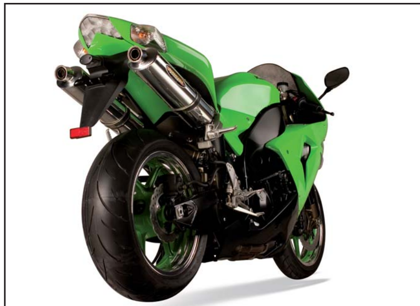
Kawasaki ZX10R Bolton Xtreme High up underseat Dual oval