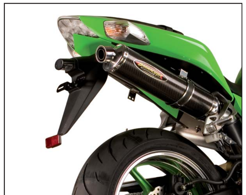
Kawasaki ZX10R Bolton Xtreme High up underseat oval single rechts/right kompletter anbaufertiger Kit mit Adapter