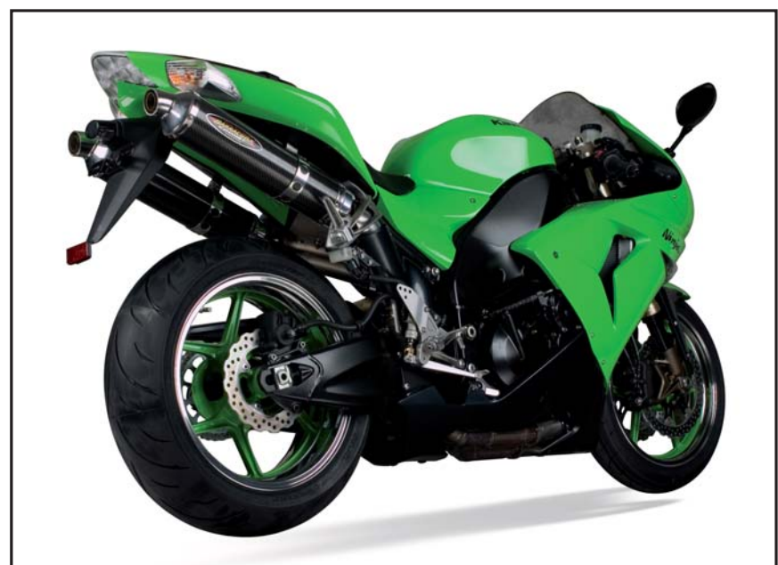
Kawasaki ZX10R Bolton Xtreme High up underseat Dual rund/round